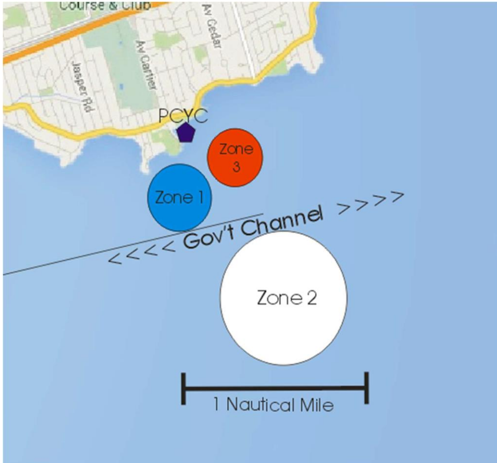
ILLUSTRATION OF THE RACING AREAS